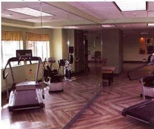
A portion of the Rehabilitation Gym at Wauconda HealthCare

We also feature two therapy gyms which have the latest in rehabilitation equipment, including the award winning NuStep. The NuStep, provides simultaneous upper and lower body motion to work all the major muscle groups and build strength.