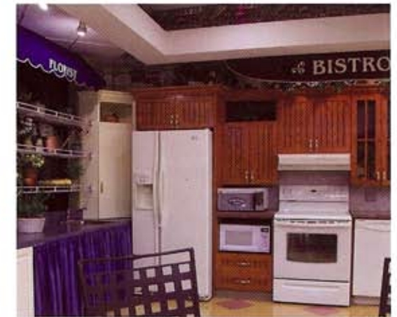
Wauconda HealthCare's Bistro is a home-like setting where patients can practice skills which will help them return to home.

Wauconda's therapy team consists of physical, occupational and speech-language therapists who are trained in the latest rehabilitation methods. Many of our staff are additionally certified in specialty areas such Kinesiotaping, Lymphedema treatment, wound care and balance therapy. We also provide E-Stim and Ultrasound treatment to enhance our patient's recovery. Specific areas of expertise held by our therapy team include orthopedic and neurological rehabilitation as well as general deconditioning resulting from a hospitalization.